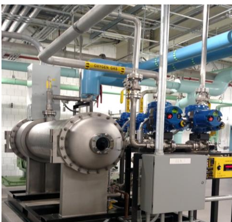
New Ozone System installed in 2017 at CLCJAWA

Our tap water quality is consistently monitored by the Village, by the Illinois Environmental Protection Agency (IEPA), in the CLCJAWA Water Quality Lab, and by other independent labs. This aggressive water quality assurance program is thorough: bacteriological tests are conducted six times more often than required, water clarity is monitored every 10 seconds, and our water is checked for hundreds of contaminants annually.